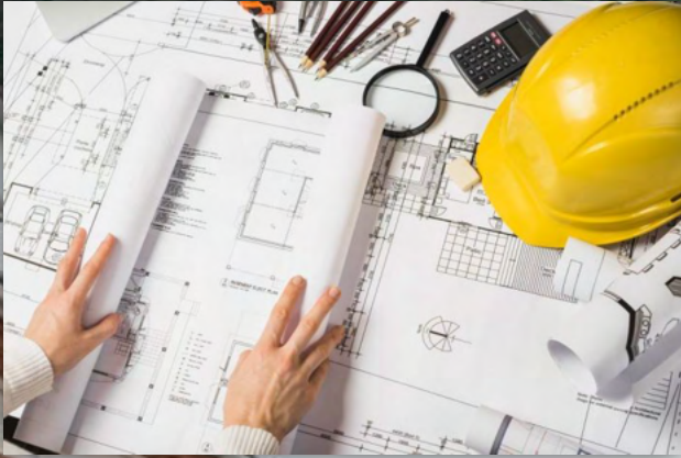
Prepare detailed drawing