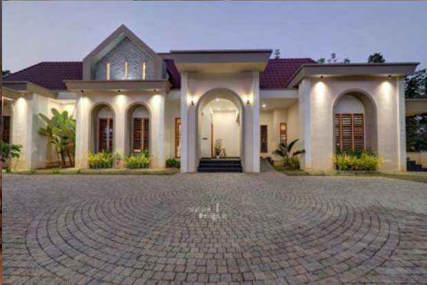
Finishing dream project